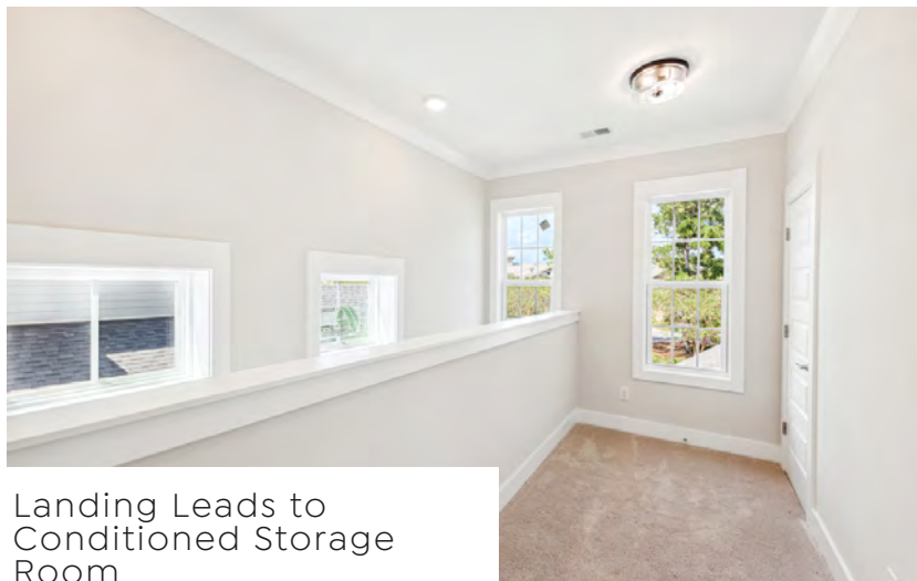
Landing Leads to Conditioned Storage Room