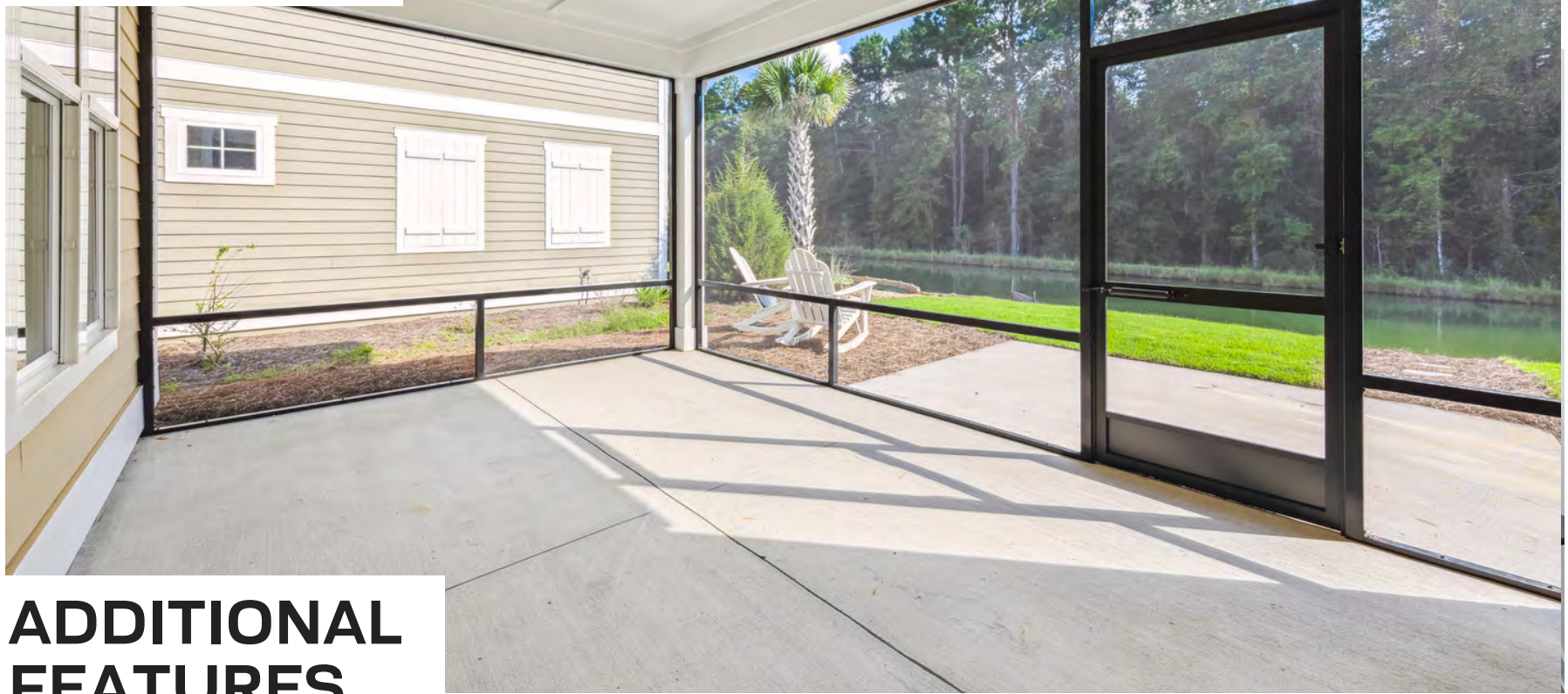
Screened Lakeside Patio