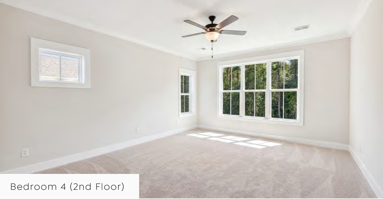
Bedroom 4 (2nd Floor)