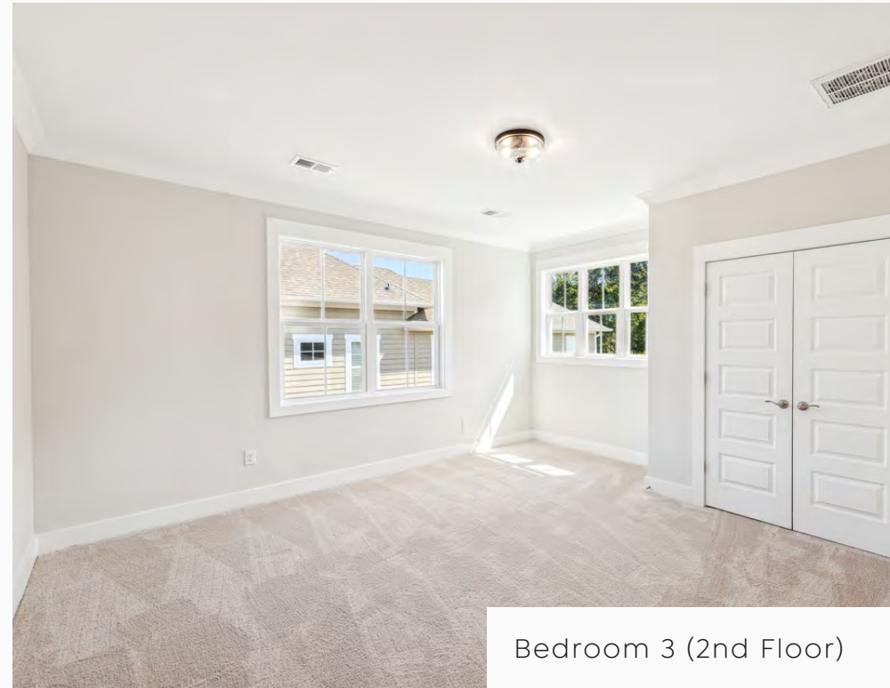
Bedroom 3 (2nd Floor)