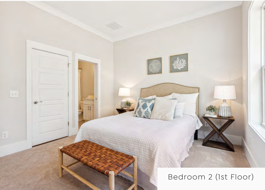
Bedroom 2 (1st Floor)