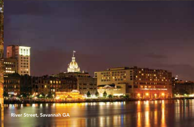
River Street, Savannah GA