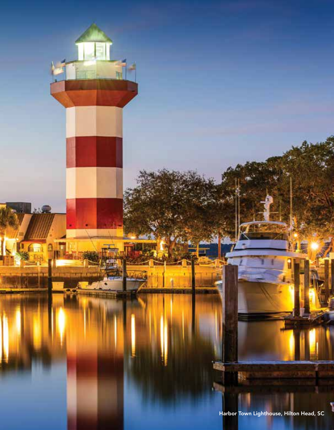
Harbor Town Lighthouse, Hilton Head, SC