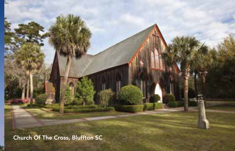
Church Of The Cross, Bluffton SC