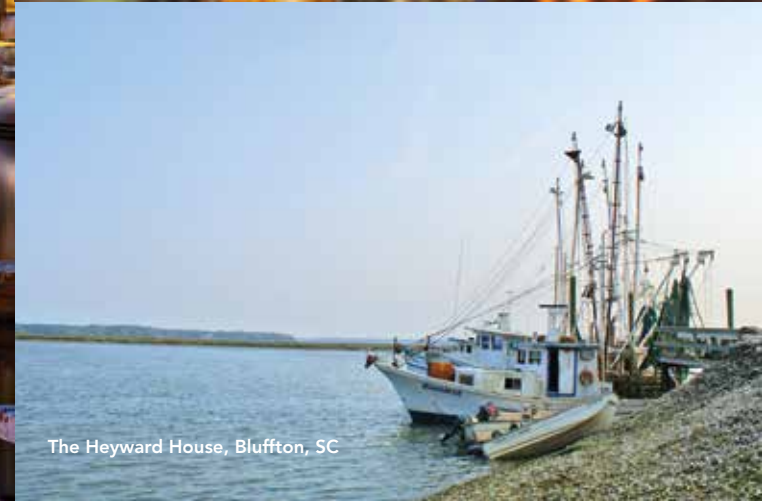
The Heyward House, Bluffton, SC